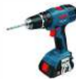
Cordless Drill Machine