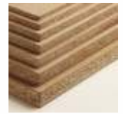
Bamboo Particle Board