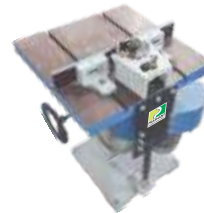
Bamboo Profile Shaping Machine (To Make Profile Shape On Bamboo)

Model No. : PBM-FT-002 Max Cutting Capacity : 50 mm Table Size : 14" x 12" Power : 1 HP Blade Length : 4" to 8" Blade Thickness : 2 - 5 mm Tilting : 45 Degree