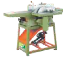
Bamboo Square Shaping Machine (To Smoother The Surface Of Bamboo)

Model No. : PBM-FP-001 Max. Circular Dia. : 300 MM Table Size : 24" x 30" Power Required : 2 HP Tilting : 45 Degree