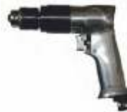
Pneumatic Drill Machine