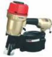
Pneumatic Coil Nailer Machine