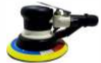
Pneumatic Sander Machine