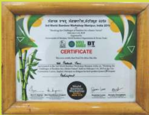
Participation of World Bamboo Workshop, Manipur