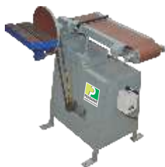
Bamboo Sander Machine (To Sanding & Polishing of Bamboo)

Model No. : PBM-OS-001 Power Required : 1HP 1440 RPM Oscillation Per Min : 75 Stroke : 1 - 1/2 inch