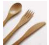
Fork & Knife