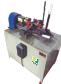
Auto Profile Making Machine (To Making Small Bamboo Toy & Gift Item)

Model No. : PBM-FT-012 Drill Capacity : 25mm Slide Capacity : 3" x 8" Power Required : 1 HP 1440 RPM