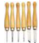
Carving Tool Set