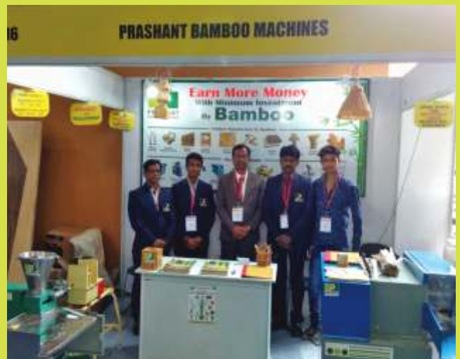
Participating Exhibition in India Wood - Asia's Biggest Exhibition - to show the new range of Bamboo Machines