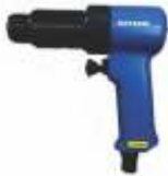
Pneumatic Nut Insert Gun