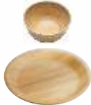
Bamboo Bowl & Plates