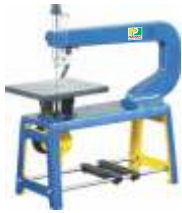
Bamboo Profile Cut Machine (To Cut the Bamboo In Profile Design)

Model No. : PBM-FT-007 Max. Width : 225 mm Power Required : 2 HP Table Length : 1220 mm. Cutter Block Speed : 4000 RPM