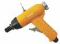
Pneumatic Screw Driver Machine