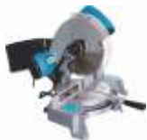
Mitre Saw Machine