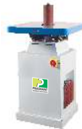
Bamboo Oscillating Sanding Machine (To Sand The Bamboo By Oscillating Movement)

Model No. : PBM-FT-004 Max. Width : 10" Power Required : 2 HP 1440 RPM Feeding : Auto Feed by 2 Roller