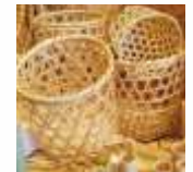
handicrafts & Basketry