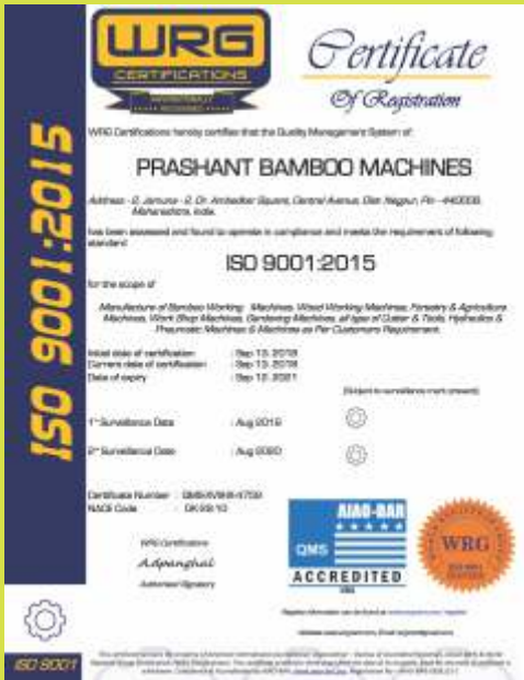
ISO Certificate ISO 9001-2015