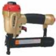
Pneumatic Brad Nailer Machine