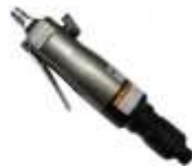
Pneumatic Die Grinder