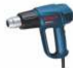
Heat Gun Machine