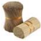
Round Stick For Agarbatti