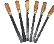
Bamboo Turning Tool Set