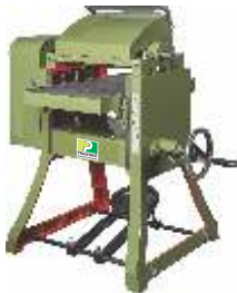
Bamboo Sizing Machine (To Make The Required Thickness Size Of Bamboo)

Model No. : PBM-FP-006 Table Size : 24" x 24" Movement of Spindle : 100 mm (Up and Down) Power Required : 2 HP 2800 RPM