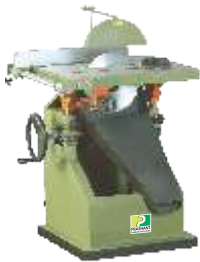
Bamboo Cutter Machine (To Cut The Bamboo)

Model No. : PBM-FP-001 Max. Circular Dia. : 300 MM Table Size : 24" x 30" Power Required : 2 HP Tilting : 45 Degree