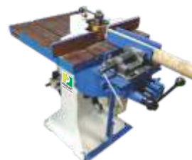
Bamboo Finger Joint Making Machine (To Make The Finger In Bamboo Strip)

Model No. : PBM-FT-009 Max. Planning Width : 10" Feeding Speed : 24Ft. per min Power Required : 2 HP 1440 RPM Length of Surface table : 1140 mm Cutter Block Speed : 4000 RPM