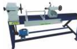
Bamboo Turning Machine (To Turn The Bamboo In Required Round Shape)

Model No. : PBM-FT-005 Disc Dia. : 250mm Belt Size : 150x1220mm Power Required : 1 HP 1440 RPM Tilting : Upto 90 Degree