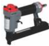
Pneumatic Stapler Machine