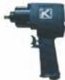
Pneumatic Impact Wrench