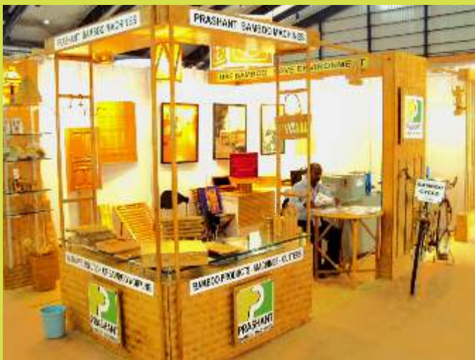
To promote the Bamboo product. We are participated in Exhibition showing the wide range of Bamboo Product