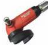
Pneumatic Angle Grinder