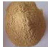
Bamboo Dust Powder