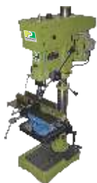
Drill Machine with Slide Attachment (For Drilling & Slide The Hole)

Model No. : PBM-FT-003 Max. Dia. : 8" Working Length : 3.5' Turning Tools : Set of 5 pieces Power Required : 1 HP 1440 RPM