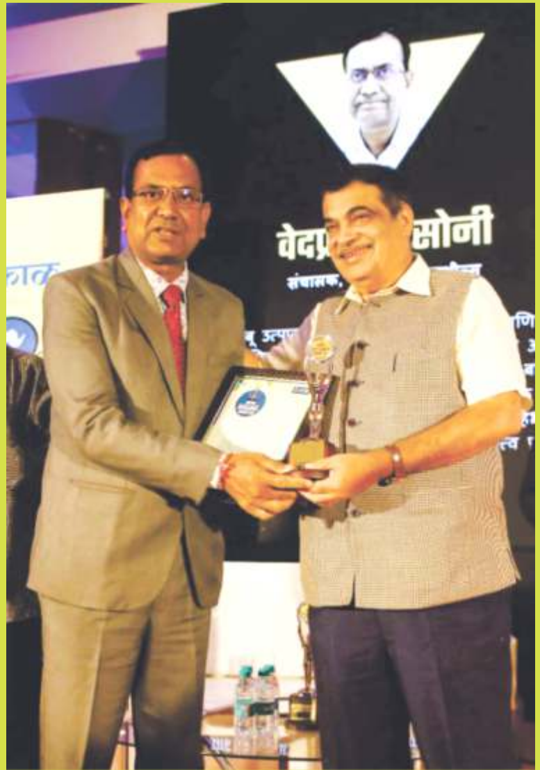
Sakal Excellence Award 2019 - Developing New Technology for Eco Friendly Product By Nitinji Gadkari Central Minister (Govt. of India)