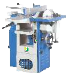
Multi Bamboo Working Machine (Multi Function for Bamboo Furniture)

Model No. : PBM-FT-010 Working Head : 3 Outer Dia. : 50mm Power Required : 1HP 1440 RPM